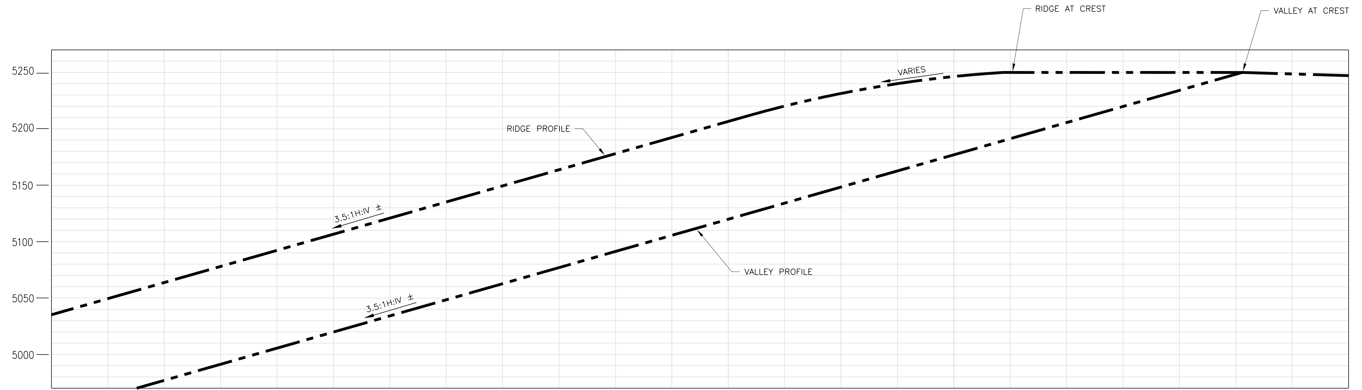
SECTION - UPPER RIDGE AND VALLEY PROFILE (TYPICAL)

X:\Clients\Augusta - Closed Project MPO and FS\Augusta Resource - Reclamation\5.0 Reports-Deliverables\5.2 Final Reports\Figures (Cadd)\REVISION C\FIGURE 25.dwg SAVED:1/31/08 PRINTED:3/11/08 BY:LENOVO USER